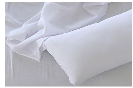
What Mattress Should You Get?