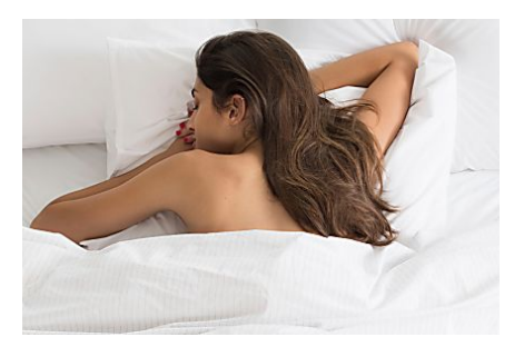
Absolutely the Best Sheets You'll Ever Sleep in