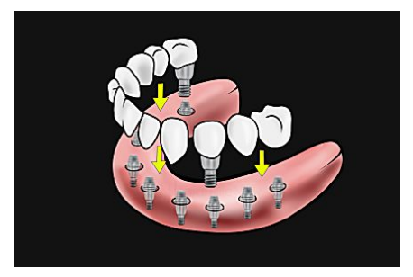
Here's What New Dental Implants Should Cost You - View Pricing & Dentist...