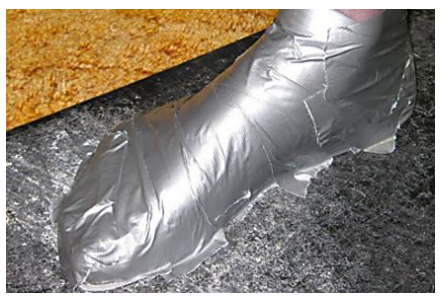
If You Suffer From Callused Feet, Try This Amazing Trick!