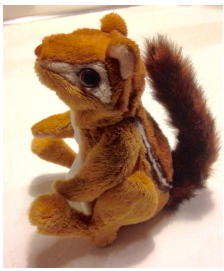
A sign of good breeding: This week's second prize, an electronic chipmunk.

Here's a contest that we seem to have done only once before, long ago — in fact, it was one of the last contests posted by the Empress's predecessor, the Czar, before he went off to spend more time with his family at the end of 2003. And more than 13 years later, it could use some fresh names. This week: Take two people from history, past or present, and tell what their child would be like, as in the examples above from Week 533. New this time: In 2003 we insisted that the parents be one male and one female; this time, same-sex unions are fine with us.