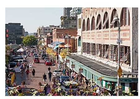
The 10 Best Neighborhoods in America