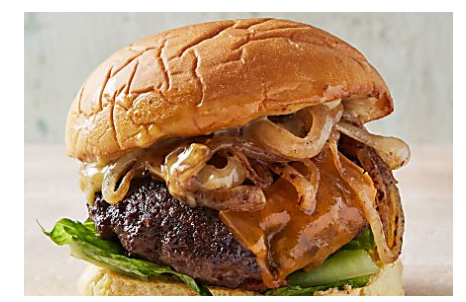
My Wife And I Tried Blue Apron: Here's What Happened